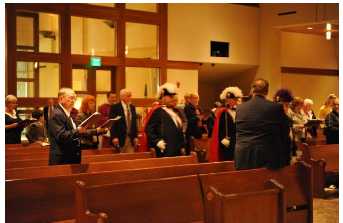
Brother Knights and Honor Guard at the Knight Memorial Mass in November