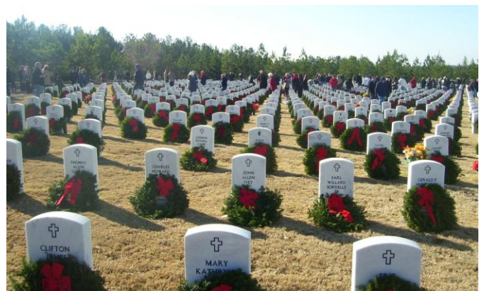
Wreaths of the National Cemetery in Canton, GA